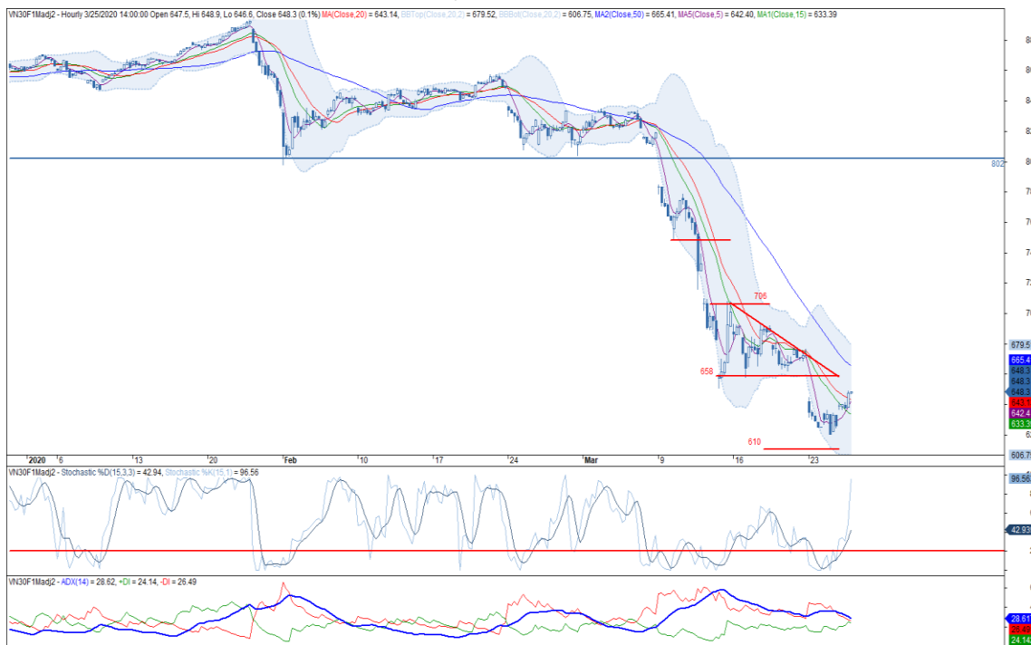
Hourly candlestick chart

Trading strategy: Long VN30F2004 at 660 pts zone when breakout occurs at 658 pts level, take profit at 706 pts and set 648 pts as the immediate stoploss level.