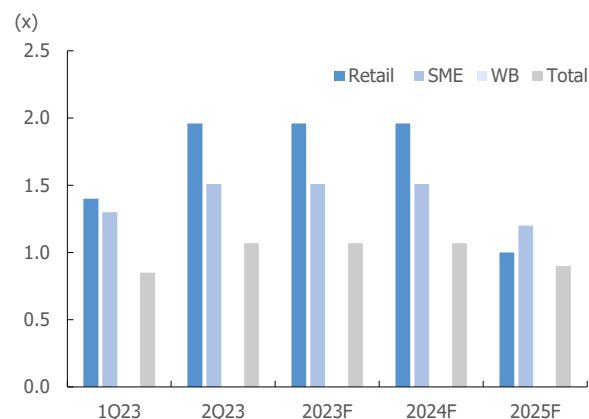
Figure 2. NPL by segment